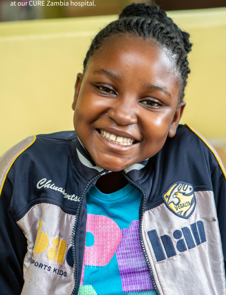
Nanga received life-changing surgery at our CURE Zambia hospital.