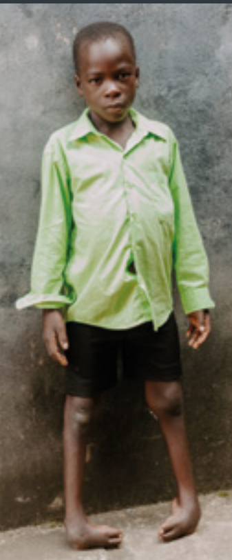
Zikomo before surgery